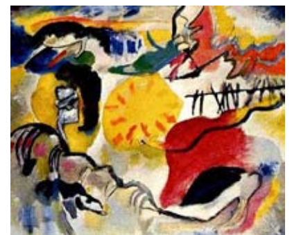
Abstract painting Vassily Kandinsky, "Improvisation No. 27 (Garden of Love)," 1912