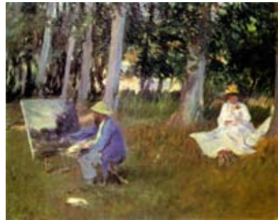
John Singer Sargent "Claude Monet Painting in a Garden, Near Giverny, 1885"