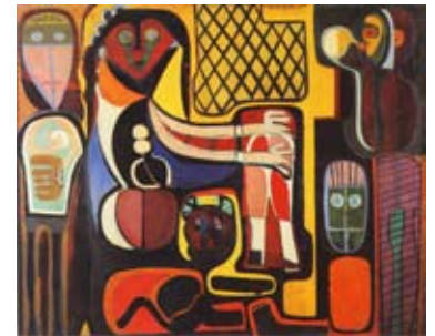
Will Barnet, "Awakening, 1949"

The first Cubist painting and the most important picture of the XXe century.