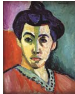
Henri Matisse, "la Ligne Verte (Mme Matisse)," 1905