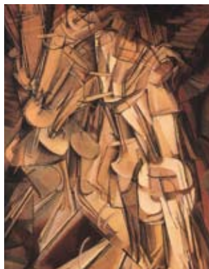
DADA, Marcel Duchamp, "Nu Descendant l'Escalier," 1912