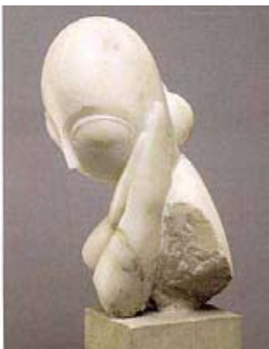
Abstract sculpture, Constantin Brancusi, "Mademoiselle Pogany," 1912