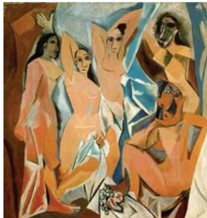
1907, Pablo Picasso, "Les Femmes d'Alger (O. J.)"

The first Cubist painting and the most important picture of the XXe century.