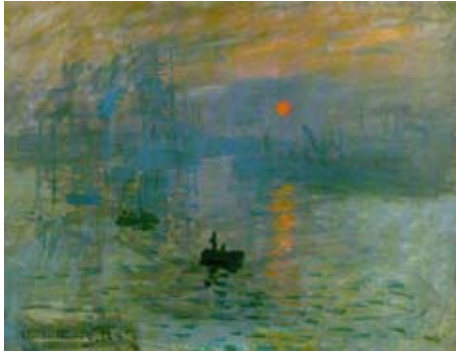
1872, Claude Monet, "Impression Soleil Levant"