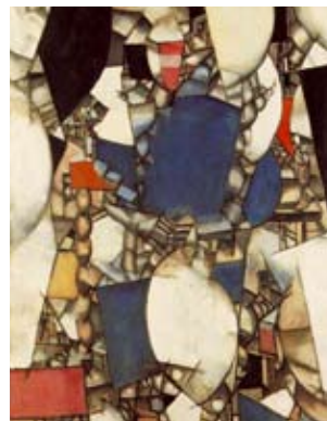
Cubist and painter of Modern life, Fernand Léger, "Woman in Blue," 1912