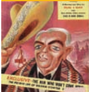
June 21 caricatures